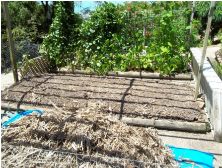
The vegie patch – ready to be sown with green manure seeds & re-covered with the mulch

Jill is just about to put in some green manure to protect and nourish the vegie garden soil during the hot days ahead. There are high timber frames around the two vegie areas, with shade cloth lengths that can be rolled over to protect young plants.